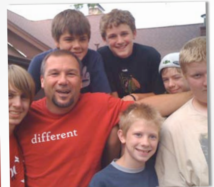
ABOUT 75 STUDENTS TRUST CHRIST IN WISCONSIN!