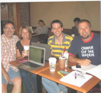
DEVELOPING DISCIPLEMAKING TRAINING IN MINNESOTA!

That's exactly what Cadre is all about: Equipping churches to make volunteers wildly successful in loving and serving Jesus Christ!