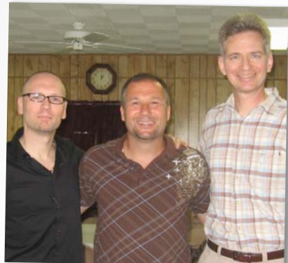
EQUIPPING EQUIPPERS TO EQUIP VOLUNTEERS!