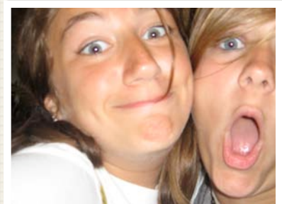
WITH EMILY GONE, JOSEY IS MOVING INTO AUBREY'S ROOM