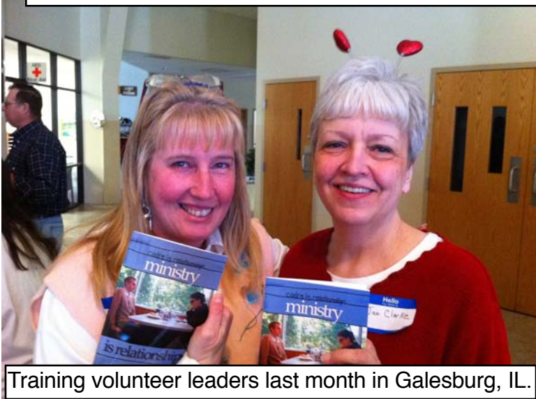
Training volunteer leaders last month in Galesburg, IL.

Your faithful prayers and generous financial support make it possible for us to give our lives to equipping others to love God, love people, and make disciplemakers. THANK YOU SO MUCH! We can't do Cadre without friends like you!