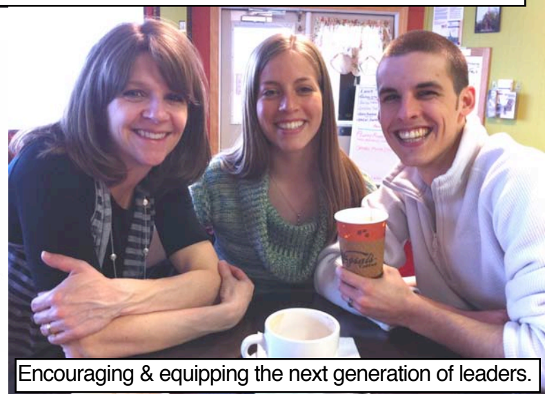
Encouraging & equipping the next generation of leaders.